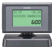
Optional Remote Display

Casio has two optional, heavy duty, black cash drawers for the QT-6600. The DL-2324 is a smaller drawer with a 5 bill/5 coin removable till for less demanding operations. The DL-3622 is the larger cash drawer for more demanding applications with a 6 coin/5 bill removable till. An optional extension cable, MDL-11, is available to remotely mount the cash drawer from the terminal.