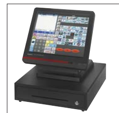
DL-2434 Cash Drawer