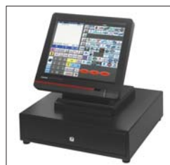
DL-3622 Cash Drawer