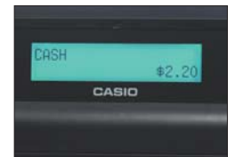
Built-in 2 x 20 Customer Display