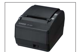
Casio UP-400 Ethernet RS232 Printer