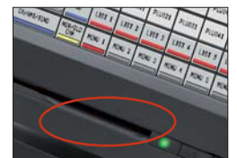
Magnetic Stripe Reader