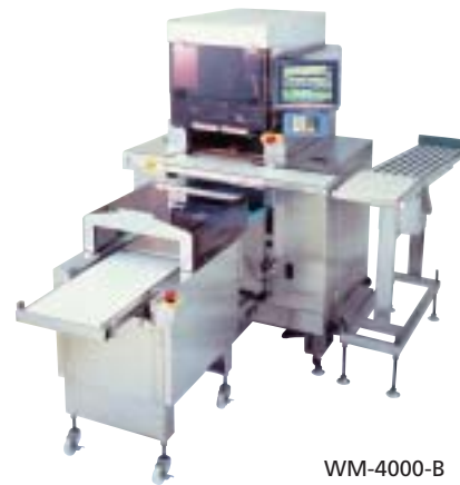
WM-4000-B + PS-EMZ (Infeed conveyor)